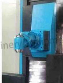
Universal Milling Head