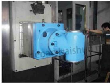
Right Angle Milling Head