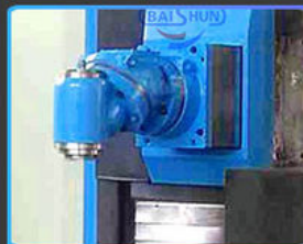
UNIVERSAL MILLING HEAD