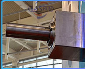
TK68 SERIES BORING MILLS WITH RAM