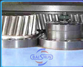
DOUBLE GEAR GAP ELIMINATING-DEVICE