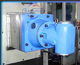
RIGHT ANGLE MILLING HEAD