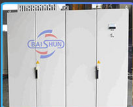
INTEGRATED ELECTRIC CABINET