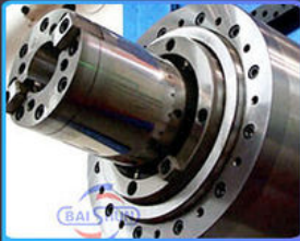
TK65 SERIES BORING MILLS WITHOUT RAM