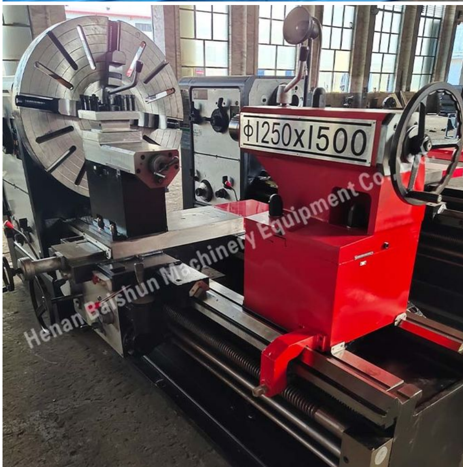
CW61125Q/CW62125Q Series Lathe Machine( 2.5 tons load capacity):