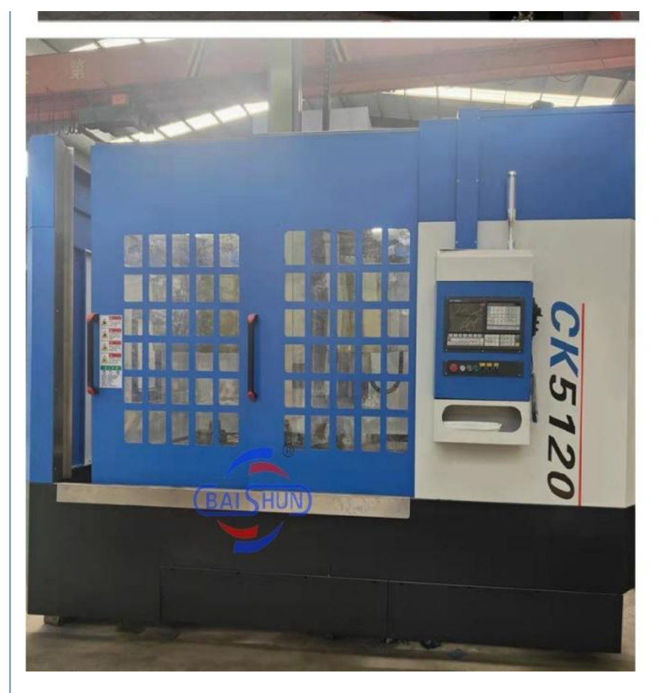
Shipping and Delivering: