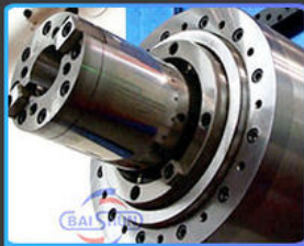
TK65 SERIES BORING MILLS WITHOUT RAM