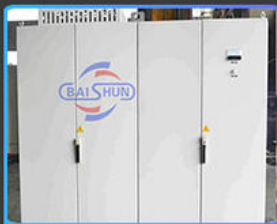
INTEGRATED ELECTRIC CABINET