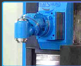
UNIVERSAL MILLING HEAD