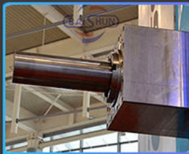
TK68 SERIES BORING MILLS WITH RAM