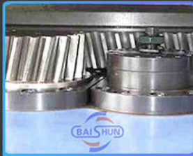
DOUBLE GEAR GAP ELIMINATING-DEVICE