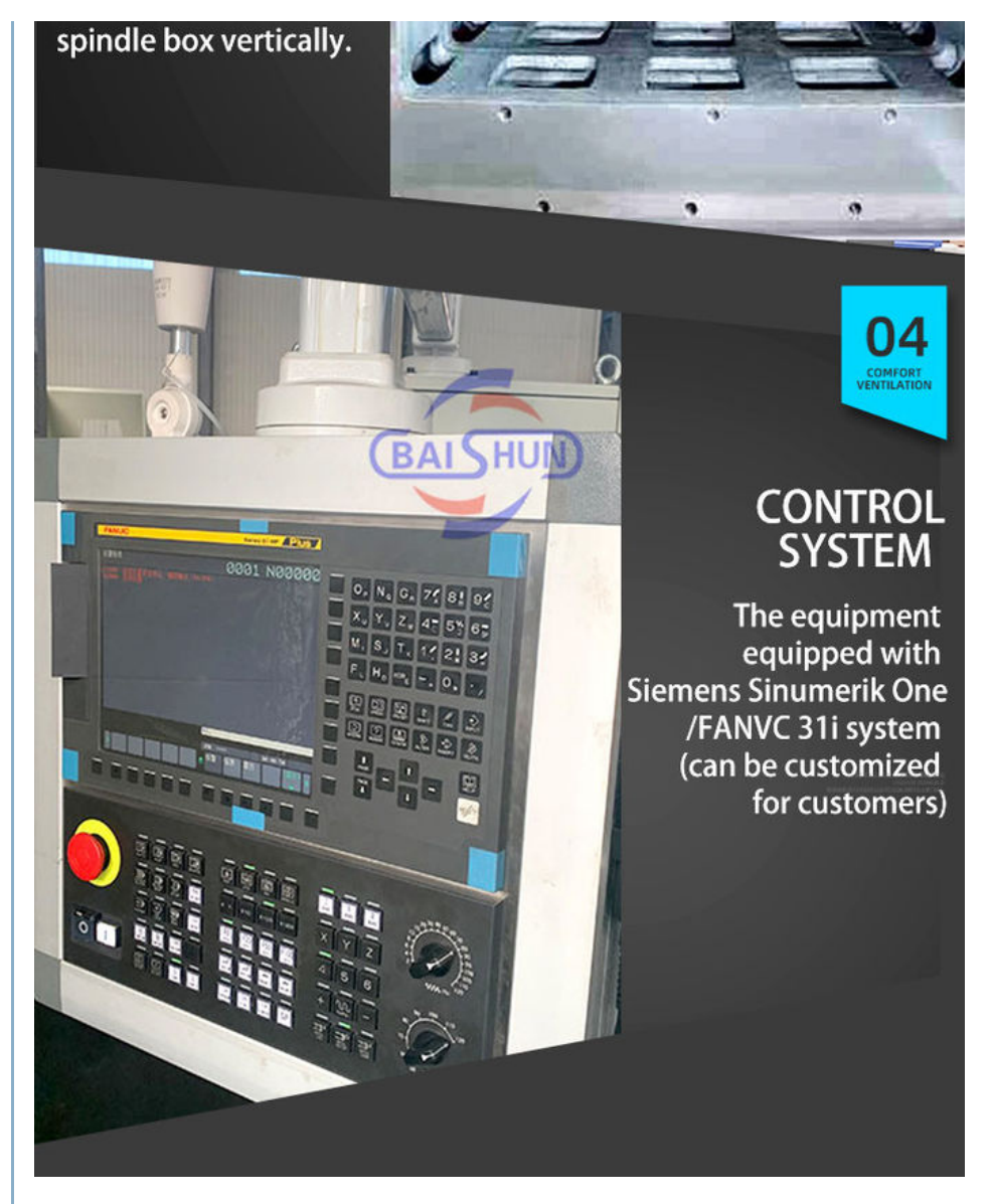
TK69 CNC Floor type boring and milling lathe machine: