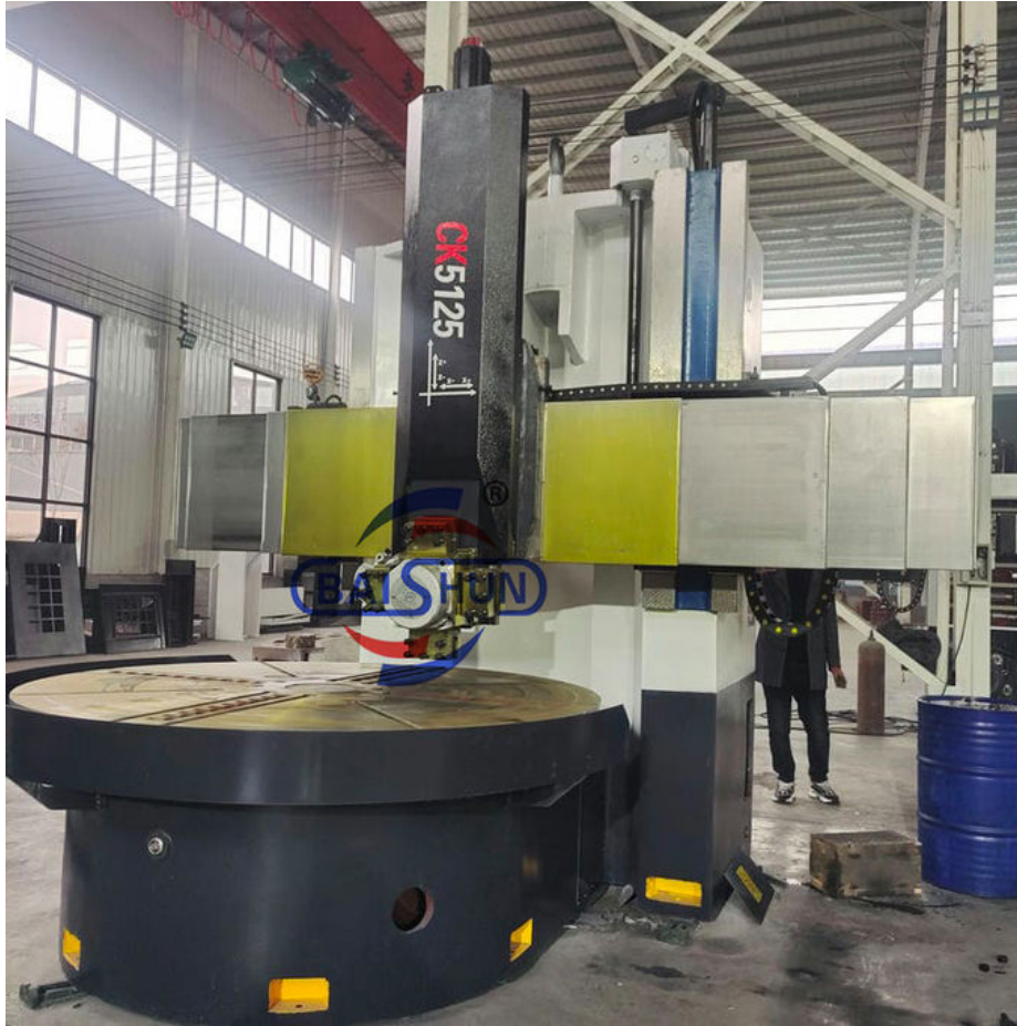
Detail Machine Photo: