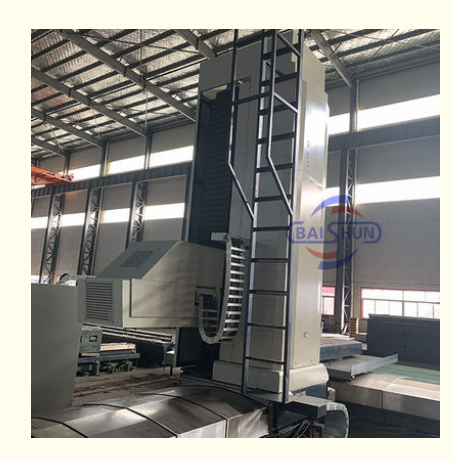
Table Type Boring Mills Machine

Highlight: Cnc Horizontal Boring Mills Machine, Horizontal Boring And Milling Machine,