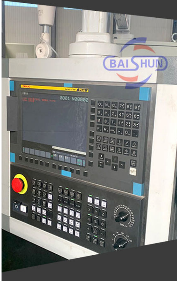
TK69 CNC Floor type boring and milling lathe machine:

The equipment equipped with Siemens Sinumerik One /FANUC 31i system (can be customized for customers)