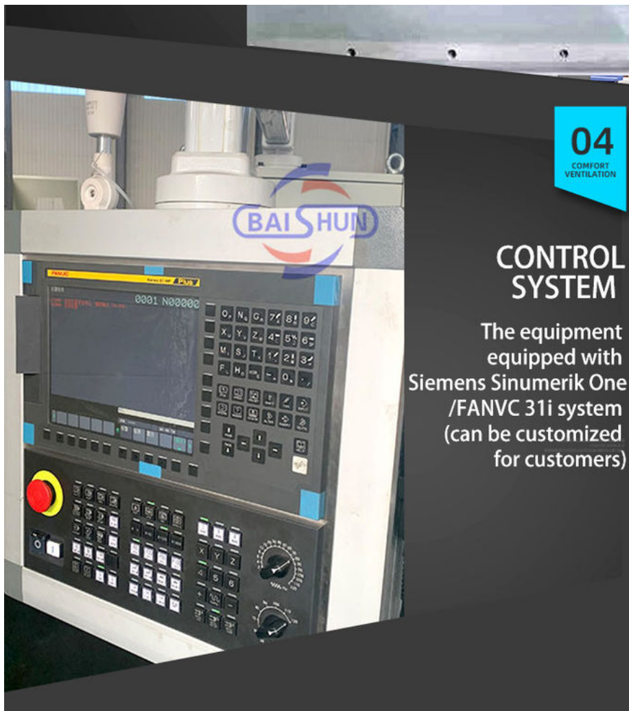
TK69 CNC Floor type boring and milling lathe machine: