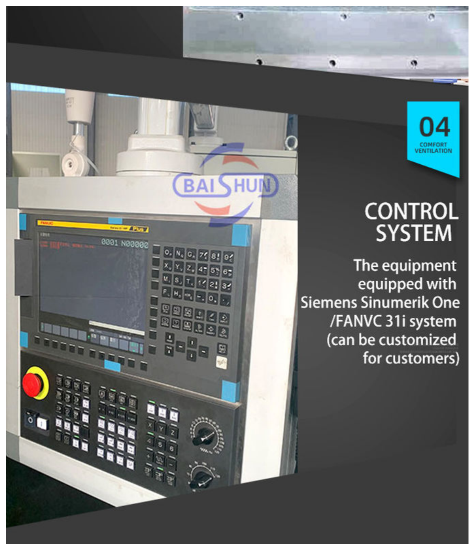
TK69 CNC Floor type boring and milling lathe machine: