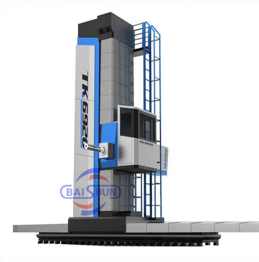
Table rotation (B axis)