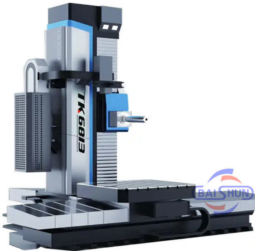
TK68 CNC Planer type boring and milling machine:

The CNC planer type boring mills are machines with large torque, high efficiency, high rigidity and advanced technologies. The machine can meet the demands of each user, including different controllers, different precision requirements, different sizes of tables by forming different models of boring machines. This series of boring mills are suitable for machining large medium sized box shaped, frame structure or moulding parts, also can perform milling, boring, drilling, winching, tapping etc after one clamping. The machine controls 7 axes with 4 axes simultaneous and allows circular interpolation and 3-D curved surface machining. Equipped with milling head, face plates and other devices, the series of machines have enlarged machining capabilities. The spindle has cooling case to limit the heat in the spindle.