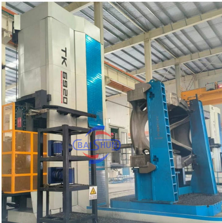
TK69 CNC Floor type boring and milling lathe machine: