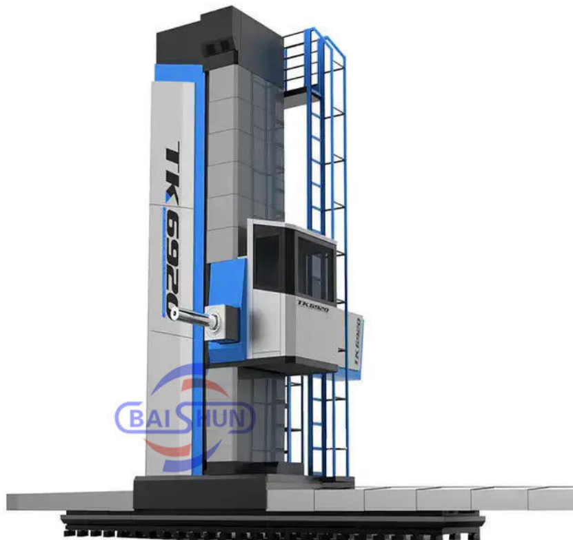
TK69 CNC Floor type boring and milling lathe machine: