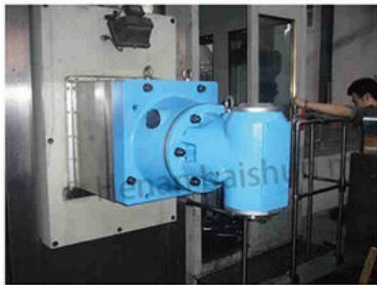
Right Angle Milling Head