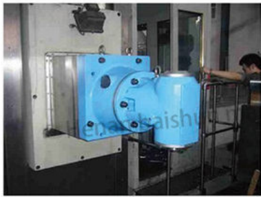
Right Angle Milling Head