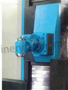
Universal Milling Head