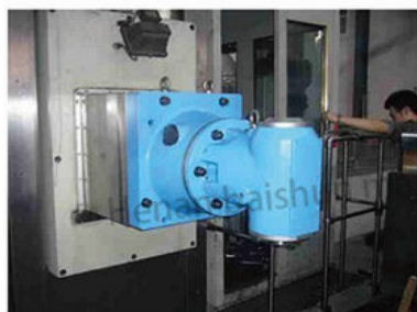
Right Angle Milling Head