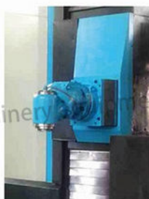
Universal Milling Head