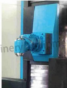
Universal Milling Head