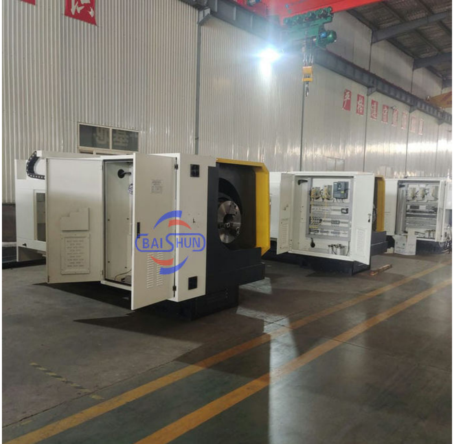
Packing and delivery: