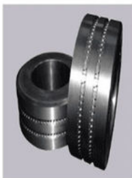
Φ8规格碳化钨辊环加工实例 D8mm TC Ring Machining Example