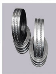
日本三菱碳化钨辊环加工实例 Japan MITSUBISHI TC Ring Machine Example