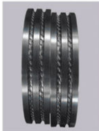
Φ14规格碳化钨辊环加工实例 D14mm TC Ring Machining Example