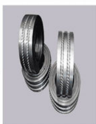
日本三菱碳化钨辊环加工实例 Japan MITSUBISHI TC Ring Machine Example