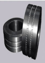
Φ8规格碳化钨辊环加工实例 D8mm TC Ring Machining Example